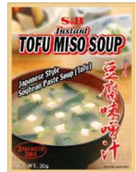
Tofu Miso Soup