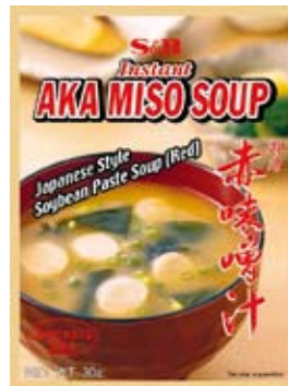
Aka Miso Soup

Miso is made from fermented soybeans and is commonly used in Japanese Miso soup, which is historically a very popular dish in Japan. Miso soup has also become one of the most popular Japanese dishes around the world, similar to sushi.