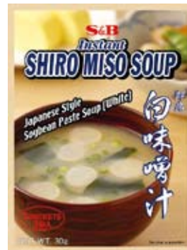
Shiro Miso Soup